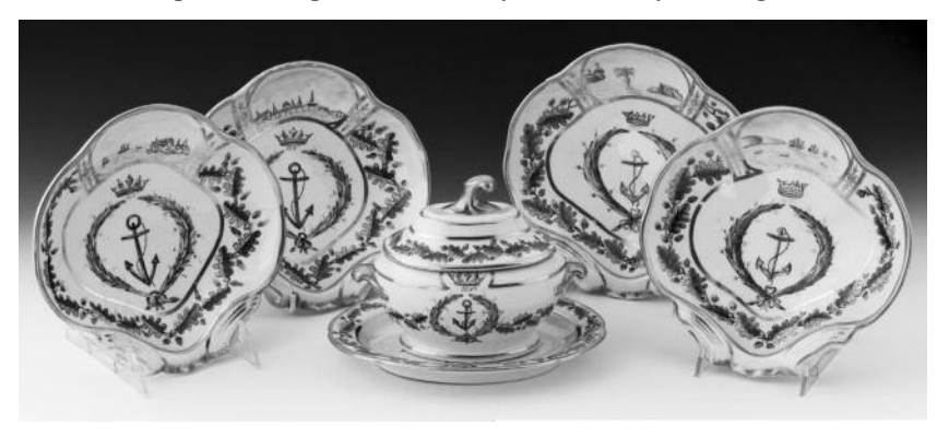
The dinner service celebrating Nelson's fortieth birthday, 29 September 1798. It is of English manufacture, probably Coalport, and decorated in Naples.

The fouled anchor motif can, therefore, be charted to have first been used by Scottish admirals in the 1500s and by the English a century later. It came to symbolise the British navy as a whole during the latter years of the 1700s, and went on to represent the pre-revolutionary French navy. Throughout much of